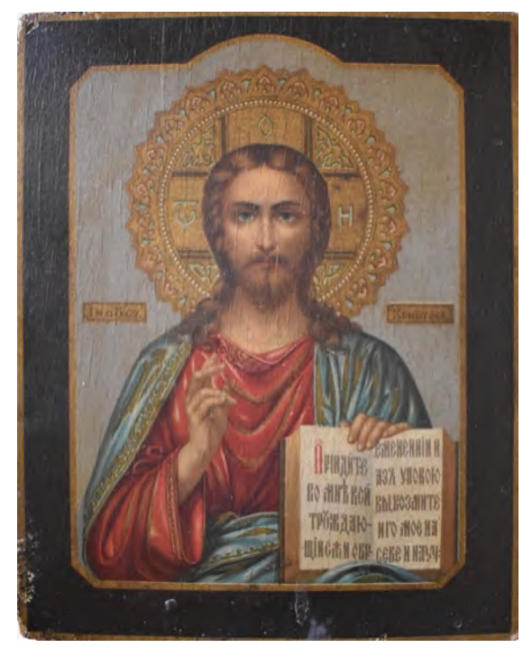
Fig. 6. Russian Epitaph, St. Elijah Monastery in Roustika, Rethymno Province.